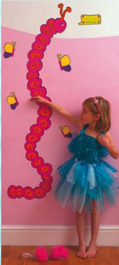
Appendix I Converting Feet to Inches